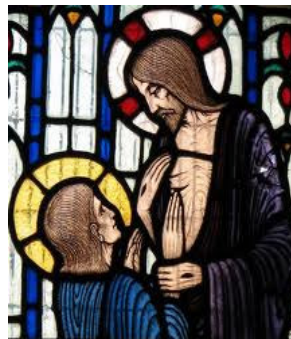
Patron Saint of architects and builders

Tradition teaches that Thomas' missionary travels led him to the Southwest coast of India in 52 AD where he first proclaimed the Gospel to Jewish settlers living along the Malabar coast in what is today part of Kerala State.